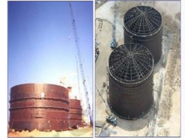
Storage Tanks Erection