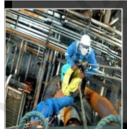
Piping net Inspection