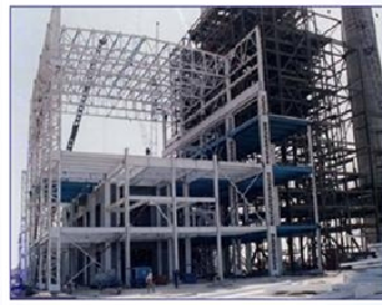
Steel Structure Erection