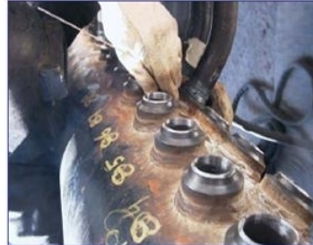
Piping Fabrication Workshop